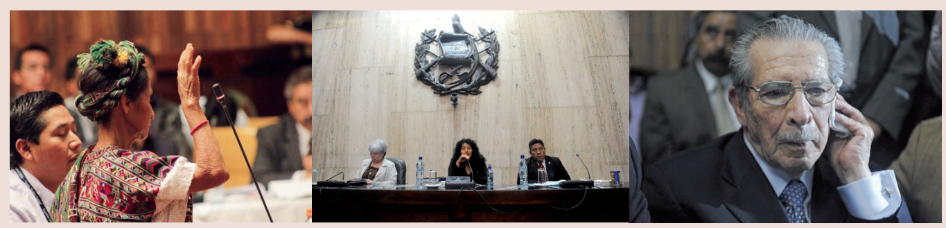
Sources: CB24, CADH and La Prensa de Honduras Genocide trial against Ríos Montt

Nicaragua spent more than a decade in a war where between 30 and 50 thousand people lost their lives. During the Somoza dictatorship and the Sandinista governments, forced disappearances, assassinations, persecution, extra-judicial killings, and forced displacements were committed. These are not only serious human rights violations, but also crimes against humanity. Unlike Guatemala and El Salvador, once the conflict ended, Nicaragua did not create a Truth Commission to investigate these acts. In 1990, the Sandinista Government approved Law 81 that granted total amnesty to the Sandinista army and the Contras between 1979 and April 1990.