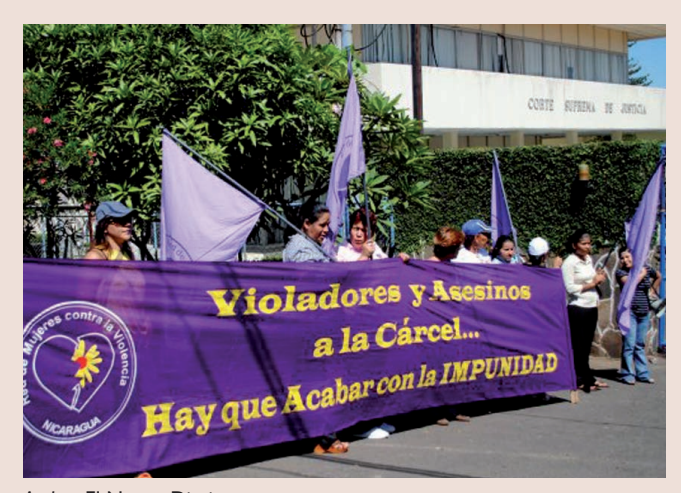
Author: El Nuevo Diario A group of women protest in front of the Supreme Court, demanding the punishment of aggressors against women's human rights.

women. The normative hopes to guarantee the rights of women of any age to a life free of violence and protect their rights when they have been victims of violence within the context of relationships of unequal power, thereby preventing and penalizing all kinds of violence against this sector of society. According to official data between January and July of 2013, there were 28 registered cases of women violently assassinated; 16 were classified as femicides. During this same period in 2012, less than half the number of women was killed by domestic violence (7 cases up until June 2012), which is classified as "alarming" by Panama's Peoples Defense. If this trend persists, the number of women killed by domestic violence will exceed 53 cases registered during 2012<sup>13</sup>.