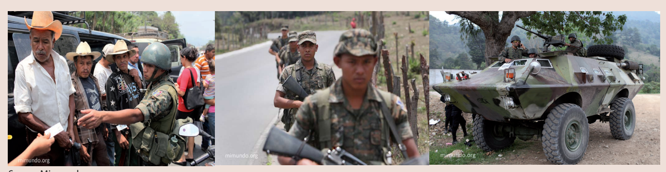
Martial Law in San Rafael Las Flores, Santa Rosa, and Mataquescuintla, Jalapa, Guatemala after a series of anti-mining protests.

The inhabitants of four municipalities in Guatemala provide a particularly illustrative case of this. They have been criminalized by authorities for opposing mining activities in San Rafael, which prejudices local health and the environment. The mine is part of the Canadian Tahoe Resources Company. In this context, the government has used police and military force to repress the dissent, justifying the acts under the argument that organized criminal groups and drug traffickers have infiltrated themselves among the protestors. They have also declared martial law in the departmental capital in the municipality of Jalapa Mataquescuintal, and the Casillas and San Rafael Las Flores municipalities, in the department of Santa Rosa.