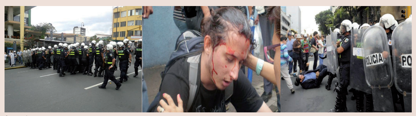
A march demanding the reestablishment of different health services in Costa Ricas's different hospital is violently repressed.

In Costa Rica, President Laura Chinchilla's current administration made heavy use of police and political repression in the last year, especially for limiting participatory spaces, by means of criminalizing social protest. The most representative case of repression has been the protests to defend the Costa Rican Social Security Fund -CCSS in Spanish-. On November 8th 201262, thousands of people took to the streets to defend the public healthcare services, social security, and demand the reinstatement of different medical services in the country's hospitals. They also denounced the passage of the "Gag Law" or the Law of Information Crime that implemented a series of limitations on citizens' and the medias' ability to denounce corruption. The law creates jail sentences for leaking documents, among other things. This protest was heavily repressed and resulted in the arrest of 21 people, the majority of whom were union leaders<sup>63</sup>, supporters of the leftist party and the Broad Alliance Party, university students and an informal vendor who was not participating in the protest.