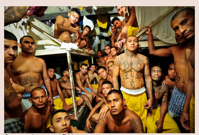
Incarcerated population in El Salvador, piled into cells without adequate food or rehabilitation programs.

There is deficient food for the incarcerated. Costa Rica designates 197 million dollars a year, Guatemala invests 66.6 million dollars, Panama 34.5 million dollars, El Salvador 32 million dollars, Honduras 18.5 million and Nicaragua 10.7 million, which does not adequately guarantee the right to food for incarcerated persons.