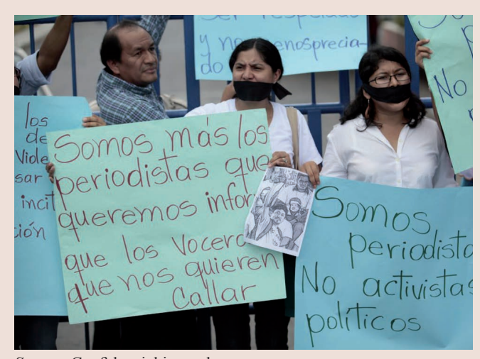
Journalists protest outside of the Supreme Court in Managua

On May 29<sup>th</sup>, 2013, Nicaraguan journalists from different media outlets protested with their mouths covered in black tape, as if gagged, in front of the Supreme Court in Managua. They demanded that authorities stop aggressions and blockades against the journalists' work. For example, the deportation of the French Press Agency's –AFP– photographer Héctor Retamal, as well as the aggressions suffered by La Prensa's press teams (who are critical of the government) when they try to cover news<sup>77</sup>.